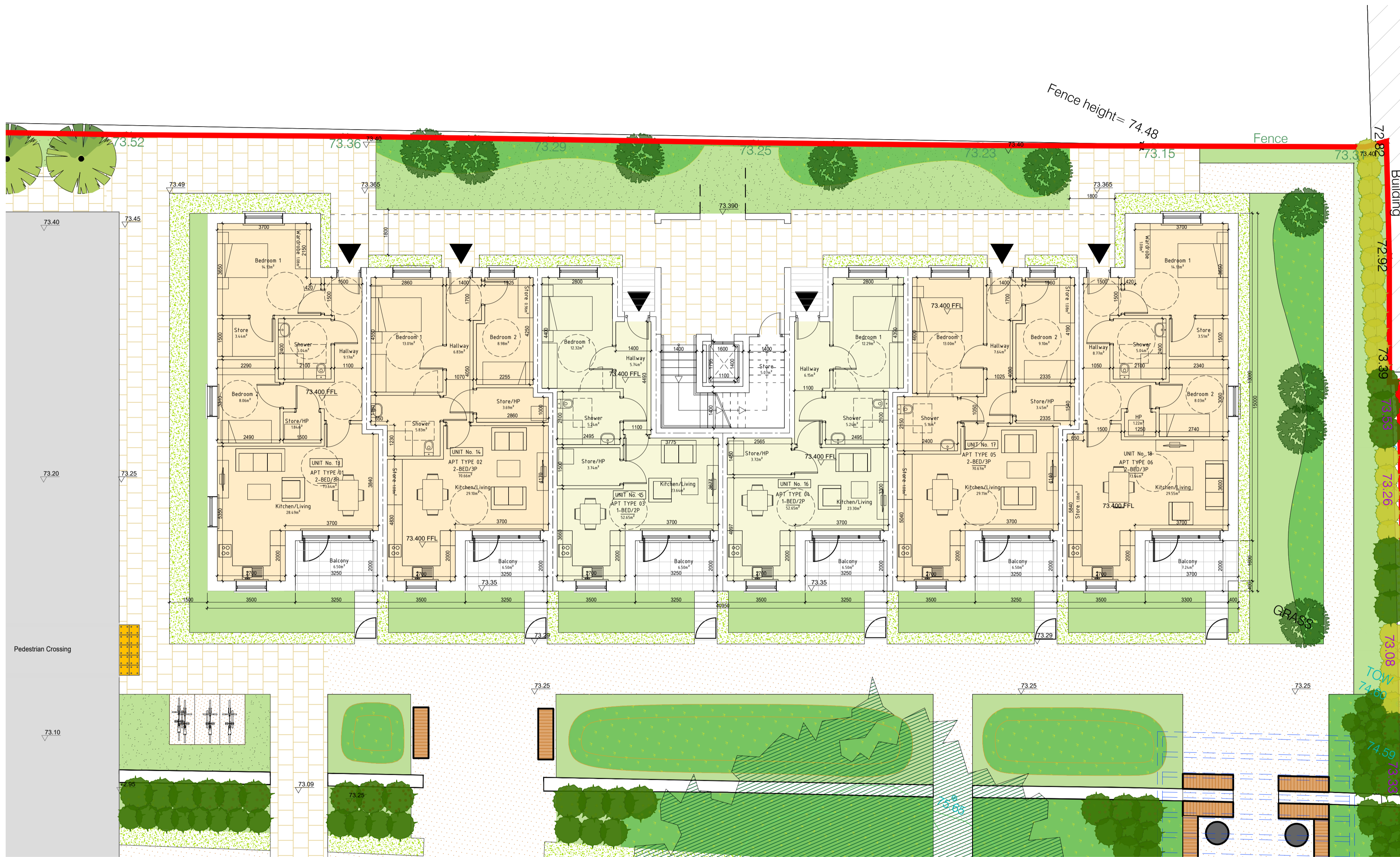
Building B - Proposed Ground Floor Plan Scale 1:100 @ A1